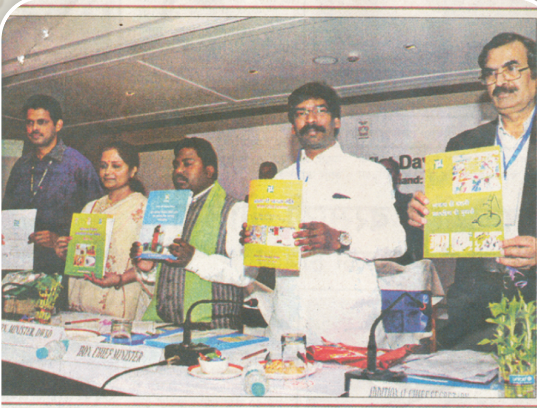
रांची : विश्व शौचालय दिवस पर होटल बीएनआर में आयोजित कार्यक्रम में झारखंड की स्वच्छता नीति पर पत्रिका का