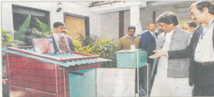
Chief minister Hemant Soren takes a look at a low cost toilet model, in Ranchi on Wednesday.

As former minister in charge of drinking water and sanitation in the BJP-led government, Soren had announced that every village in Jharkhand will get a water pipeline by 2017. However, on Wednesday as head